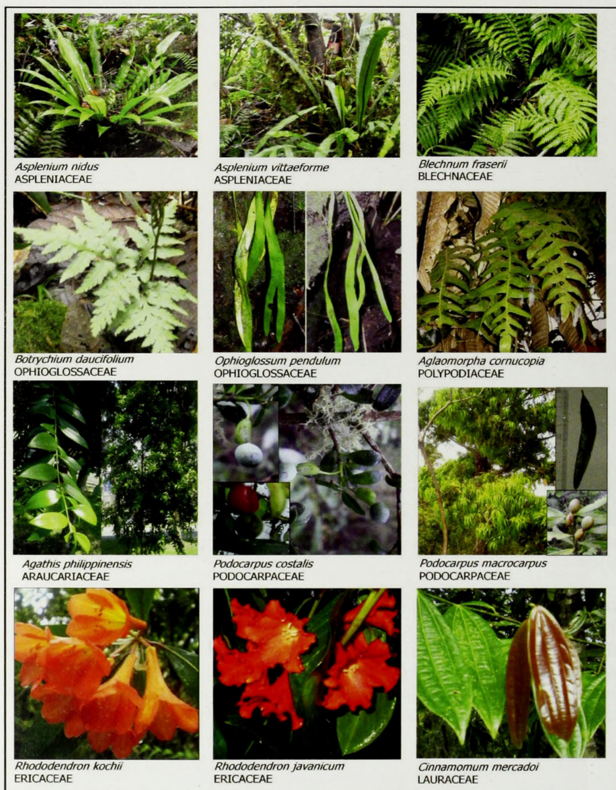
Fig. 5. Some threatened plants of Mt. Kitanglad, Bukidnon, Mindanao.

Recommended policies for the PAMB include: (1) The LGU's of Intavas and other LGUs around the park should officially organise their porters/guides for long-term monitoring of threatened and endemic species. (2) Ex-situ and in-situ conservation of species and habitats should be carried out to protect the remaining endemic, threatened, rare, and economically important species of plants. For ex-