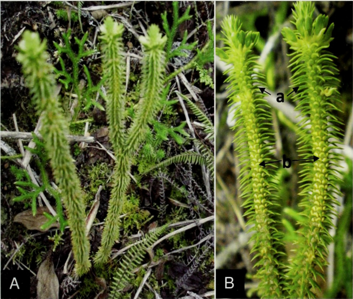
Fig. 4. Huperzia monticola Underw. & F.E. Loyd. A. Habit. B. Aerial axis showing microphylls (a) and sporangia (b).

The Information, Education and Communication (IEC) materials were prepared in the form of flyers, with relevant information such as scientific name, local name, family name and status of the floral species (Fig. 5). These help to enhance community awareness for the conservation and protection of these species, and will be disseminated to the community and local researchers and guides for their use.