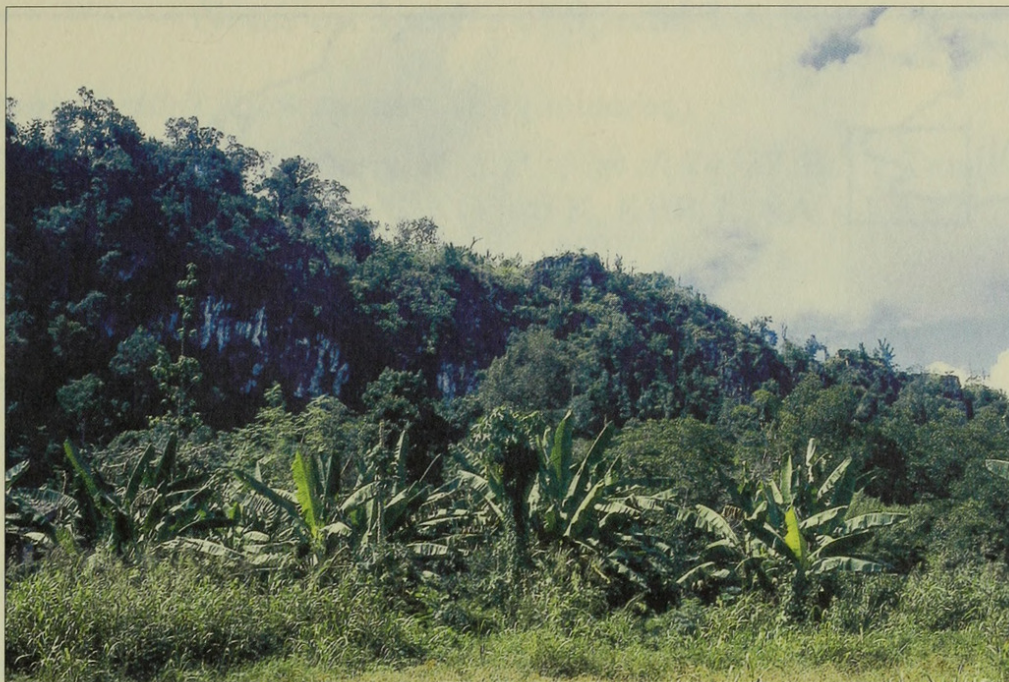
Figure 1. Batu Tengar Cave, Segarong Protected Forest Reserve. (Burnt summit visible to right)