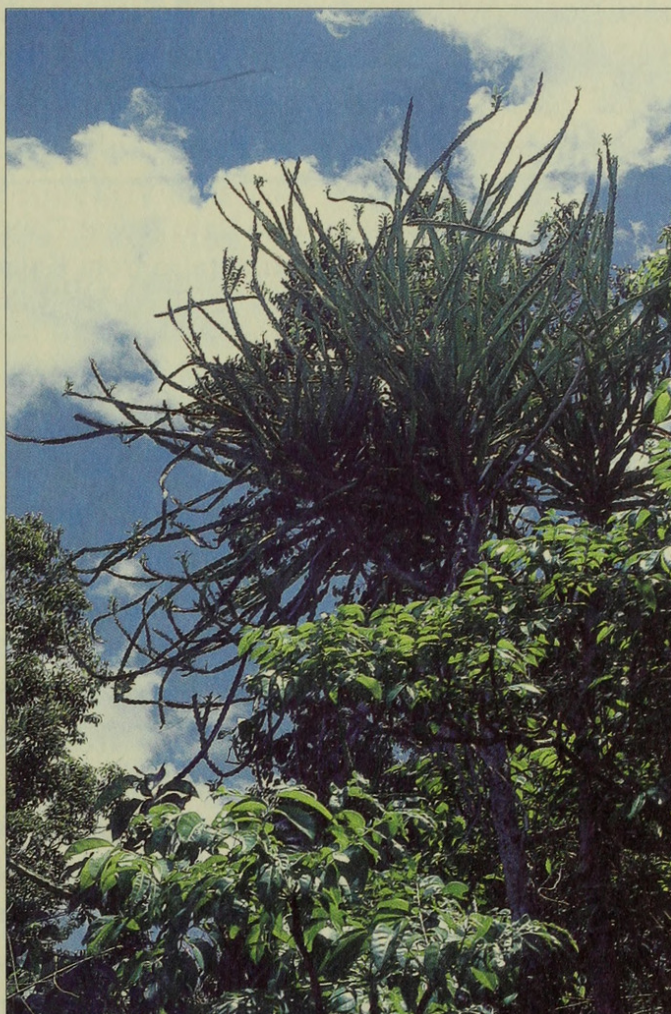
Figure 2. Euphorbia lacei Craib on the summit of Batu Tengar Cave.