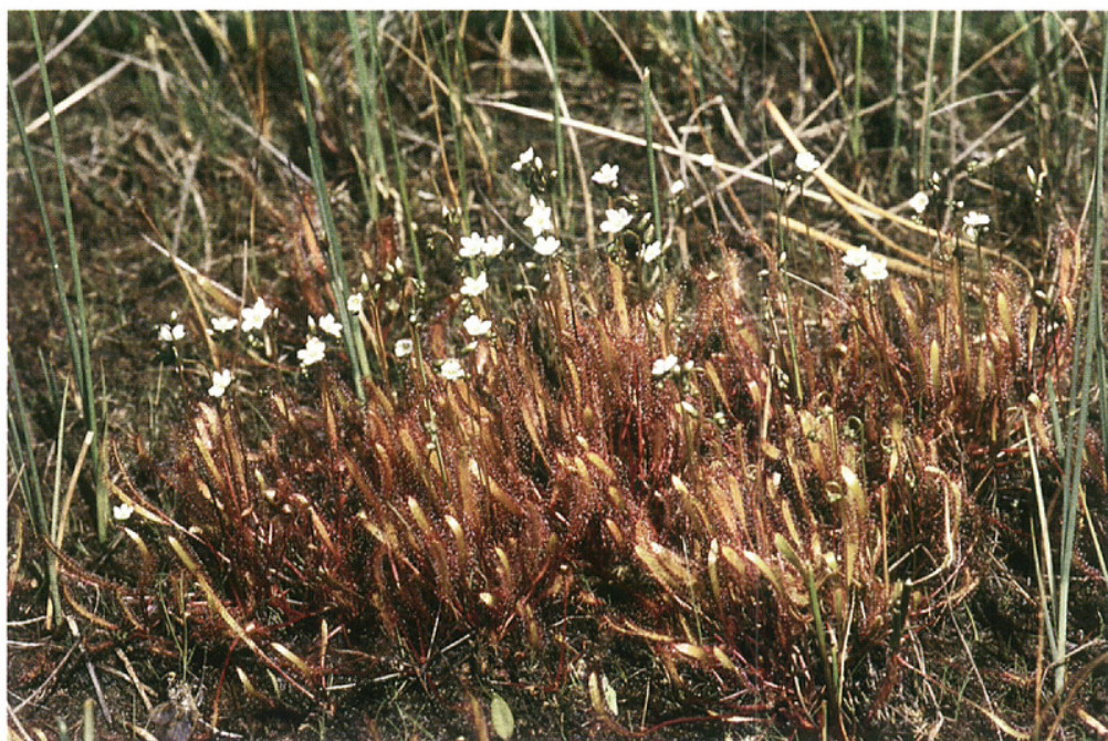
Figure 1. Putative Drosera anglica Huds. \times D. linearis Goldie in flower in Chippewa County Michigan.

Root squashes for chromosome counts were attempted but were unsuccessful due to a peculiar crystalline material within cells that interfered. Tissue sections of roots disclosed few mitoses. Young flower buds (2–3 mm) were fixed in alcohol:acetic acid (3:1), dehydrated using standard histologic technique and then imbedded in paraffin. Ten micron sections were made and stained with