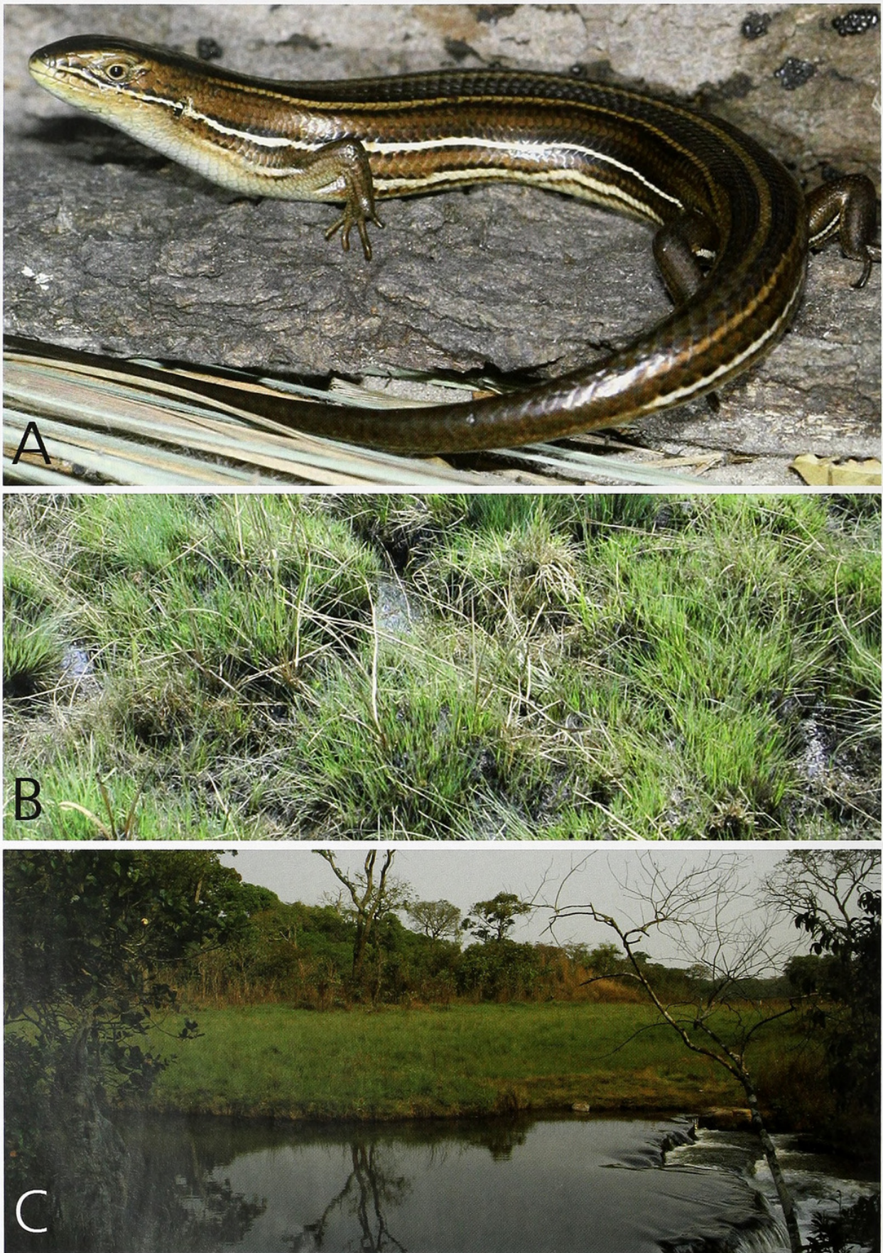
Fig. 3. Trachylepis ivensii . A= Specimen from Nchila Reserve, Hillwood Farm, Ikelenge, Zambia. B= Typical habitat of T. ivensii in the Nchila Reserve. C= Typical habitat of T. ivensii at the Zambezi north of Ikelenge.