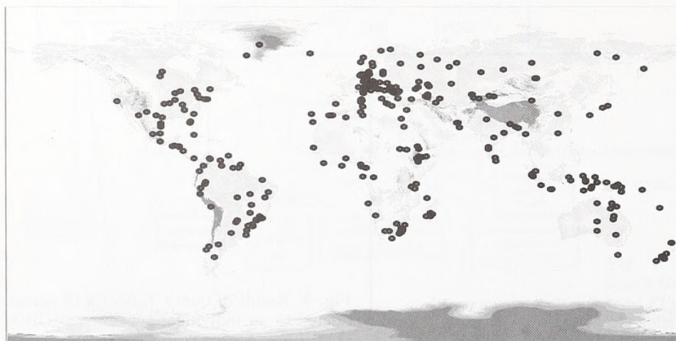
Fig. 6: Result of query 4: map of all located collecting sites referring to the collection Th. ANGELE. Collecting sites which do not exactly match geographical point information are included but not yet specifically made visible on this map by different symbols (ZOBODAT, Linz, Austria).

A change in thinking arose with the common availability of the world wide web's communication possibilities. Now it became apparently necessary to eval-