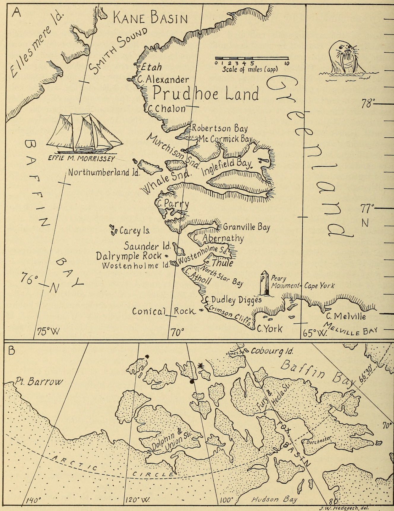
Fig. 1.—A, Detail of NW. Greenland, showing localities represented in the Bartlett collections; B, The American Arctic (only those localities from which pycnogonids have been collected are indicated). *Type locality of Boreonymphon robustum (approximate; probably also of Nymphon hirtipes ). ●Type locality of Colossendeis proboscidea (approximate).