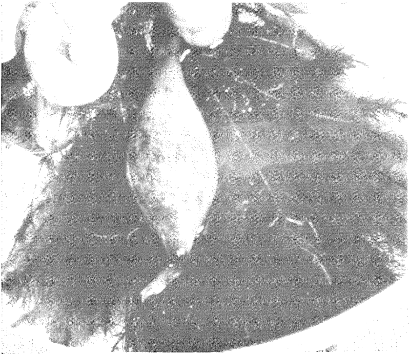
FIG. 2.—A typical Eichornia plant with the mosquito larvae firmly attached to the roots.

Preliminary screenings of solutions examined to determine if detachment and rise of the specimens could be effected, were made using larvae attached to 1" strips of brown paper file folders. Various solutions of different concentrations were tested. In all cases ordinary tap water warmed to room temperature was used as a control liquid.