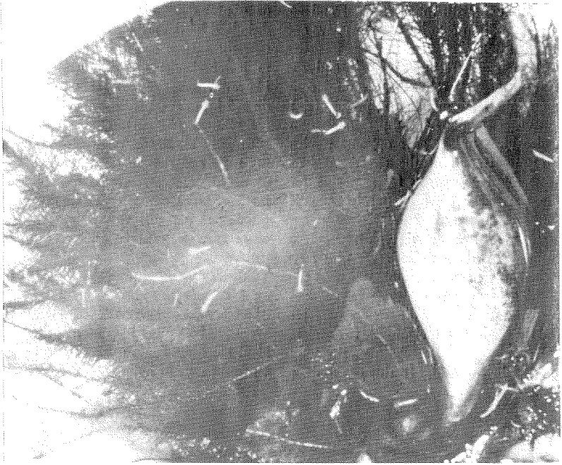
FIG. 3.—Position of the larvae after the plant has been transferred to a different battery jar and the plant shaken vigorously.

RESULTS AND CONCLUSIONS. Tap water, ice water, hot water, 1 percent hydrochloric acid, 5 percent hydrochloric acid, 5 percent sodium chloride, and 1 percent sodium hydroxide all gave negative results. However, 5 percent sodium hydroxide and 50 percent sucrose solution produced the desired result. Five percent \text{KMnO}_4 caused opacity which precluded any observations of the mosquito immatures.