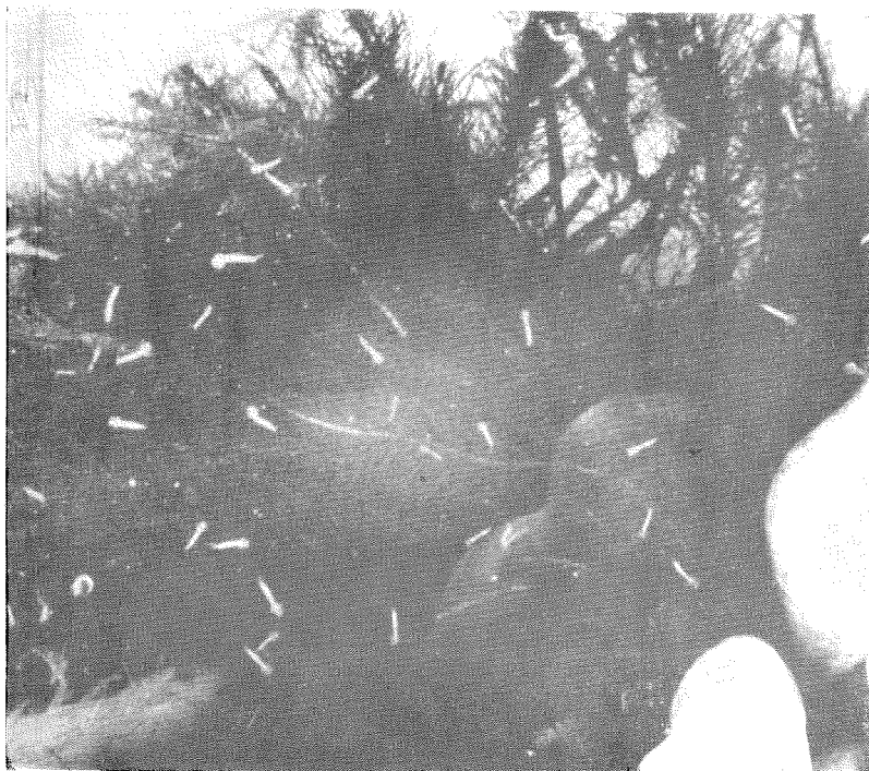
FIG. 4.— Eichornia plant dipped in 5 percent sodium hydroxide solution where all larvae have detached and risen to the surface.

SUMMARY. A technique of surveying for Mansonia uniformis immatures under laboratory conditions has been developed. When the mosquito-laden roots of the host plant are dipped into a solution of either 5 percent sodium hydroxide or 15 percent