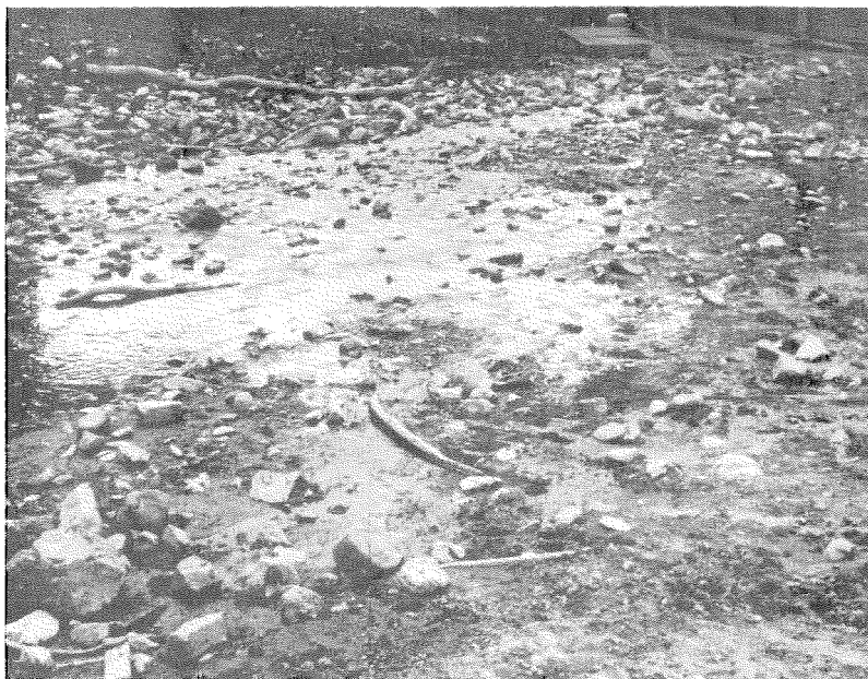
FIG. 4.—Polluted hog-lot stream which supported Culicoides crepuscularis , C. variipennis variipennis , C. haematopotus and C. venustus .

C. variipennis variipennis (Coquillett). This is an extremely abundant species in southwestern Virginia and several of the most productive habitats have been mentioned under the crepuscularis heading of this section. Almost all areas having moisture and pollution from animal feces supported at least light v. variipennis breeding for most of the summer of 1964 and to a lesser degree in 1965. Habitats in central and southwestern Virginia were