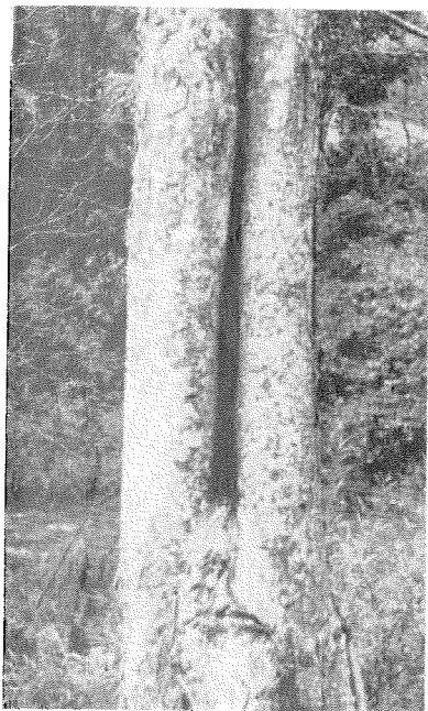
FIG. 1.—Hollow buckeye tree which supported larval populations of Culicoides arboricola , C. footei , C. hinmani and C. stellifer .

prevalent than previously indicated by the above author. Only one breeding site, the same as described for footei , was found for this species during the summers of 1964 and 1965. About 100 male and female specimens were collected from the buckeye tree.