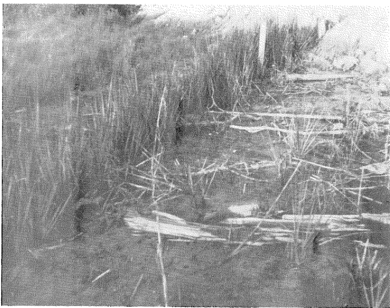
FIG. 2.—A salt marsh breeding site of Culicoides hollensis and C. furens .

C. melleus (Coquillett). Adults of this species were by far the most abundant species at Virginia Beach during the summers of 1964 and 1965. However, heavy concentrations of larvae were not found. Fifteen to 20 two-quart intertidal sand