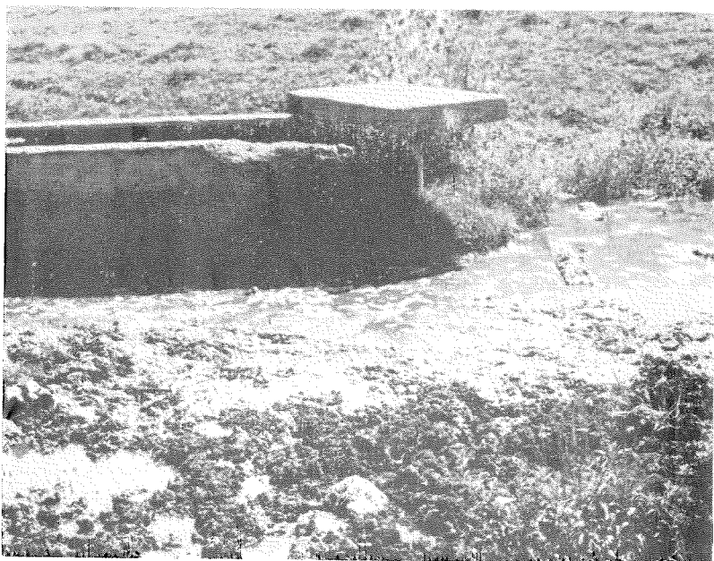
FIG. 3.—Larval breeding site of Culicoides variipennis variipennis , C. crepuscularis and C. stellifer .

Numerous other animal watering areas supported small numbers of crepuscularis and all sites at which this species was