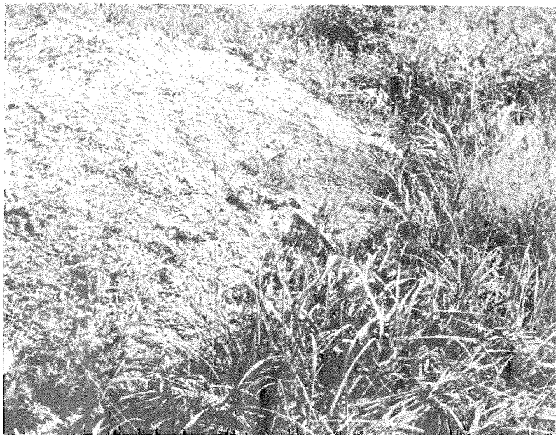
FIG. 5.—A pile of used chicken litter which provided a breeding site for Culicoides obsoletus .