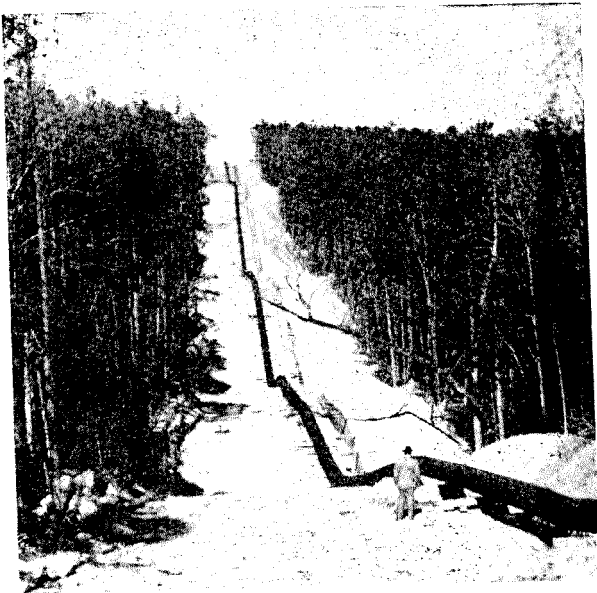
Somewhere along the route of the world's biggest oil line. This shows pipe on skids ready to be lowered into position.

On August 1st, 1942 seven experienced pipeline contractors began work on the 530 mile section of this project which runs from the oil fields in north-